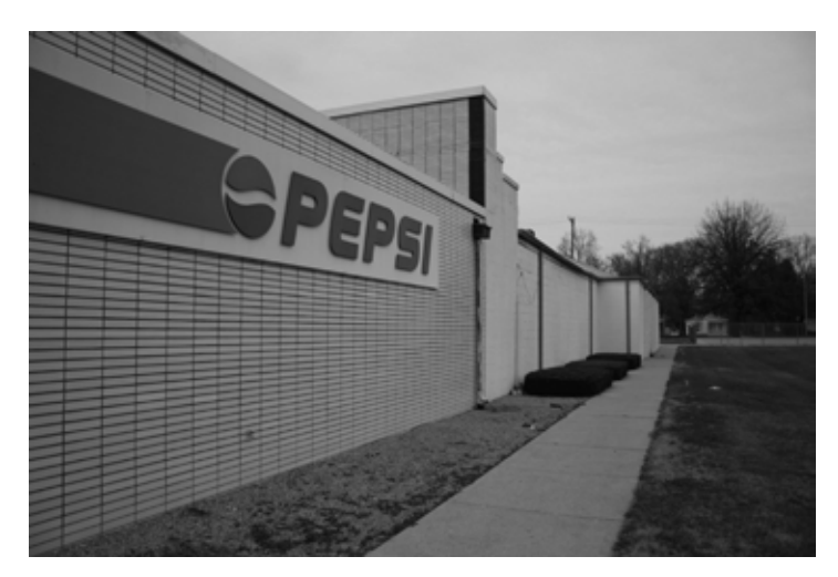
Photo of former Springfield Pepsi building at 1937 East Cook- the Foodbank's future home.

To complete the retrofit process, we will need to raise about $1 million. Had we been starting from scratch, this project could have cost anywhere from $6-8 million. The donation of the building and grounds presents a valuable opportunity.